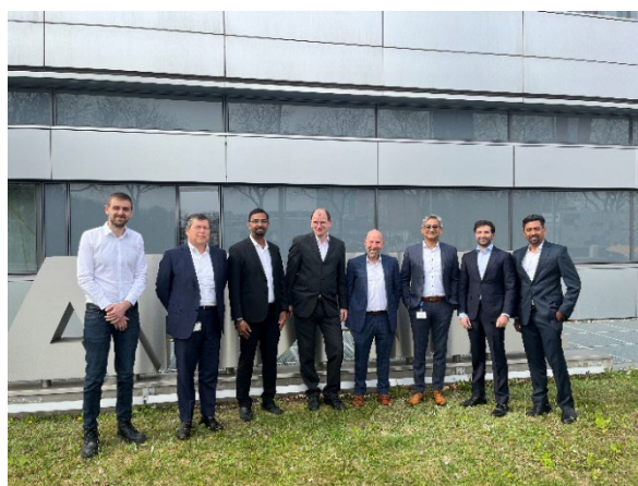
Trinity Touch and ANDRITZ project team